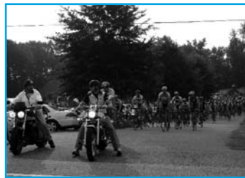
Courses start and finish at Tyger River Presbyterian Church.