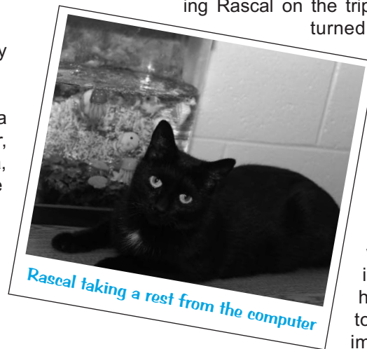
Rascal taking a rest from the computer