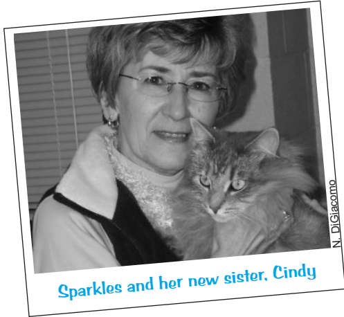
Sparkles and her new sister, Cindy